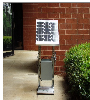
Solar Powered Outdoor DRM